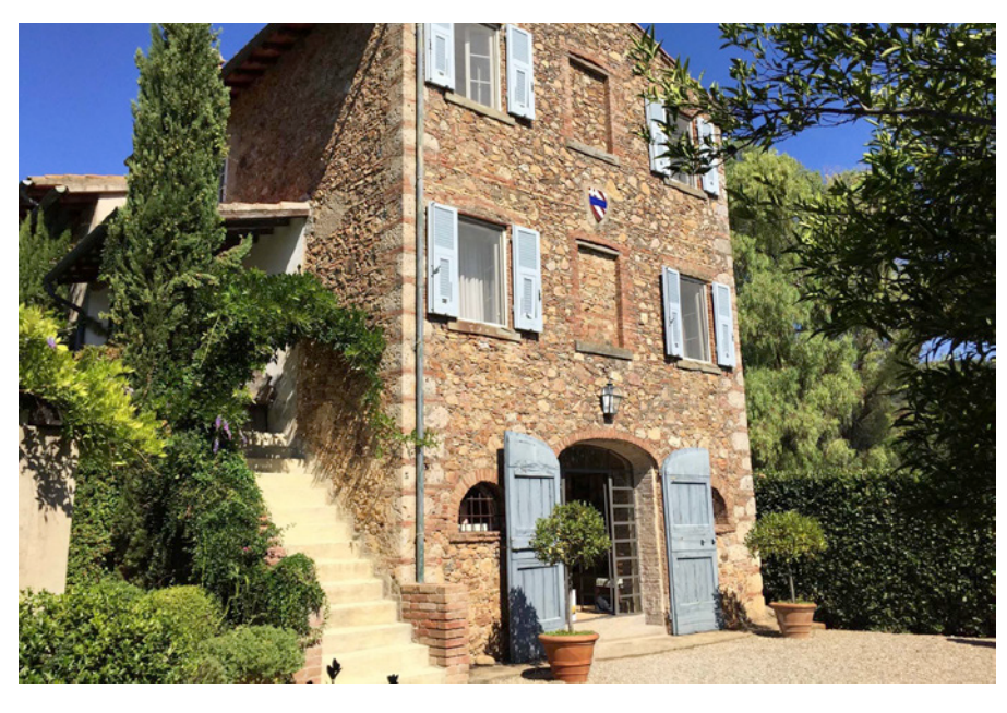
A charming home in a splendia location Villa Uliveto Porto Ercole, Monte Argentario, Tuscany An enchanting

An enchanting home, steeped in character and style, Villa Uliveto is a truly special find. Set amidst swathes of olive trees, with views to the sea, total privacy and wonderfully tasteful and original interiors, guests will cherish this delightful property in much sought after and adored Porto Ercole.