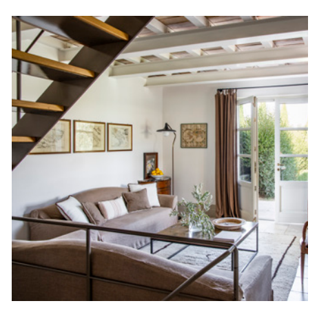
which is a fun place for enjoying a mix of Mediterranean.

Only half an hour from the Locanda are long stretches of unspoilt sandy beaches where one can enjoy long walks and a swim in the clean Mediterranean sea. The charming small, historic town of Capalbio is just five minutes away and certainly worth a visit and for those guests interested in wine then are some fabulous wineries in the vicinity and