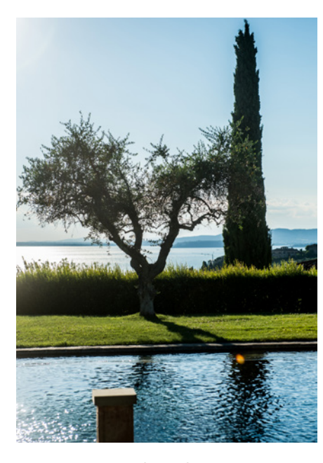
The charm, magic and total ease of living at Villa Roncone!

Tel: +39 0585 92098 | Mobile: +39 392 155 1464 | Email: info@merrioncharles.com Via Ariosto 32, Cotto, Fivizzano 54013, MS, Italy www.merrioncharles.com